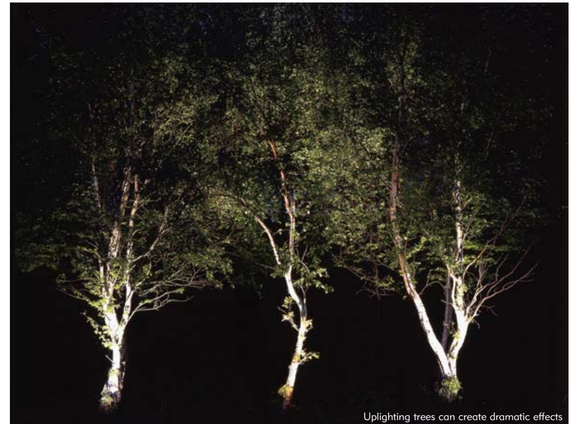
Uplighting trees can create dramatic effects

This green oak Settle is ideal for keeping the spring breeze at bay when you are sitting outdoors. It is made by Marnie Moyle (pictured here) who also hand carves it with the inscription of your choice. This particular settle has some charming words taken from Alice in Wonderland, "Why, sometimes I've believed as many as six impossible things before breakfast." We also love Marnie's Simple Bench, which is featured on this issue's front cover. Green Oak Furniture: 01635 281786 / greenoakfurniture.co.uk